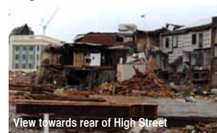
View towards rear of High Street

In December this first temporary park was dismantled, as planned, ready for the owners to rebuild offices on this valuable site. The landscaping materials were relocated to Barbadoes Street (former Piko store) and Colombo Street, Sydenham, with input from additional landscape designers.