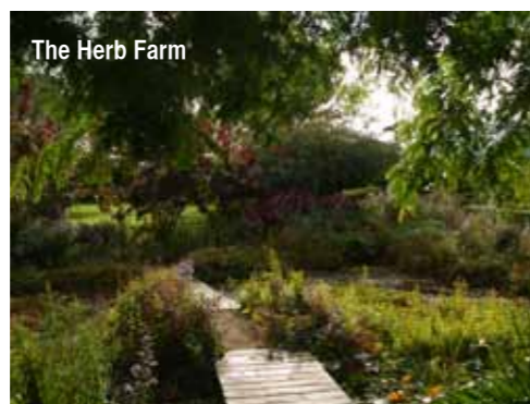
The Herb Farm

The Mirage Resort Alexandra Headland in Queensland was my destination for a relaxing break. I took the opportunity to