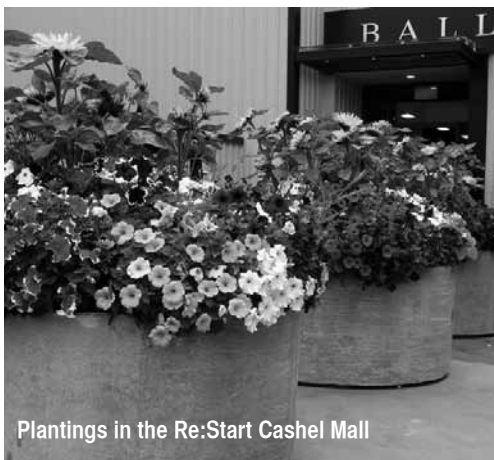
Plantings in the Re:Start Cashel Mall

It is an exciting time for the discipline of Landscape Architecture in Christchurch. Pre-existing principles of sustainability and resilience have taken on a new meaning in Canterbury where an awareness of natural hazards has increased significantly. With this in mind, many landscape architects in Christchurch have already undertaken new and exciting challenges as they are faced with an unprecedented opportunity to propose significant (and positive) alterations to our environments, making them better, more resilient places to live now and in the future.