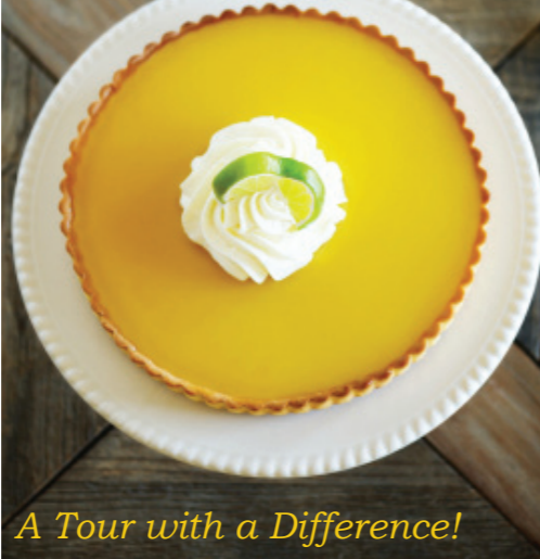
A Tour with a Difference!