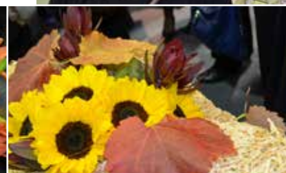
Sunflowers, artichokes, leucadendron 'Safari Sunset' & Autumn leaves nestled into a handcrafted frame made out of copper mesh & wood wool.