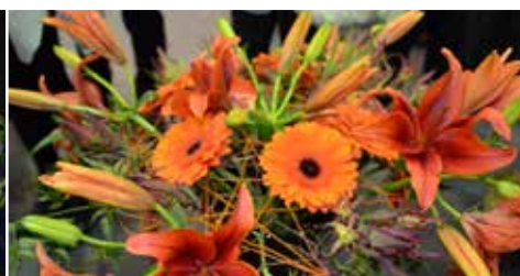
Bouquet in Autumn colours with asiatic lilies, gerberas, the rose, 'Cherry Brandy' & leucadendrons, worked through a handmade wireframe embellished with beads, ribbons & felted wool.