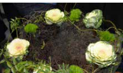
Basket of muehlenbeckia woven through a handmade wire construction to carry decorative kale & the carnation 'Green Trick' in attached water phials.