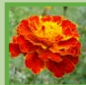
The Best Exotic Marigold Hotel