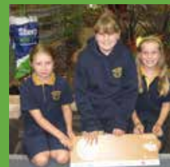
West Melton Primary students celebrate their award