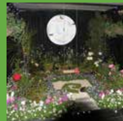
St Albans Catholic School Scented Night Garden

We want to make this event a major "must see" in Christchurch's calendar and demonstrate our commitment to horticultural innovation among the city's younger generation on whom our future depends. We need your help! Please tell your neighbours and friends about it and encourage them to see the show, and if you have children or grandchildren please take them so they may be inspired by the creativity of their peers and wish to emulate them!!