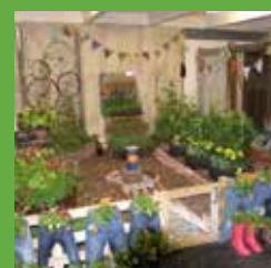
West Spreydon School Trash to Treasure